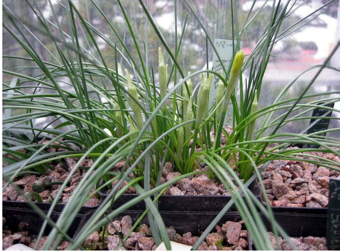
Narcissus 'Atlas Gold'

Last week I showed a pot of Narcissus 'Craigton Clanger' here is another of my selections, Narcissus 'Craigton Clumper' which was selected because it increases and clumps up very quickly indeed. Young Narcissus bulbs raised from seed always show more vigour than old forms that have been increased vegetatively over many years and perhaps picked up diseases on the way. These ones I selected stood out from their fellow seedlings by being exceptionally vigorous; producing some forty flowers from a 7cm pot.