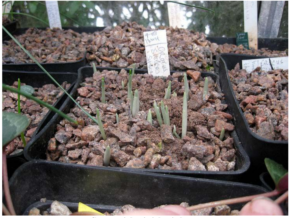
Crocus sieberi sieberi shoots

As well as the lovely flowering Narcissus it is the expectation of all these fat shoots bursting in to bloom soon that helps me through the frustration of not getting into the garden in the snow. These are mature corms of Crocus sieberi sieberi with shoots that are big enough to flower every year.