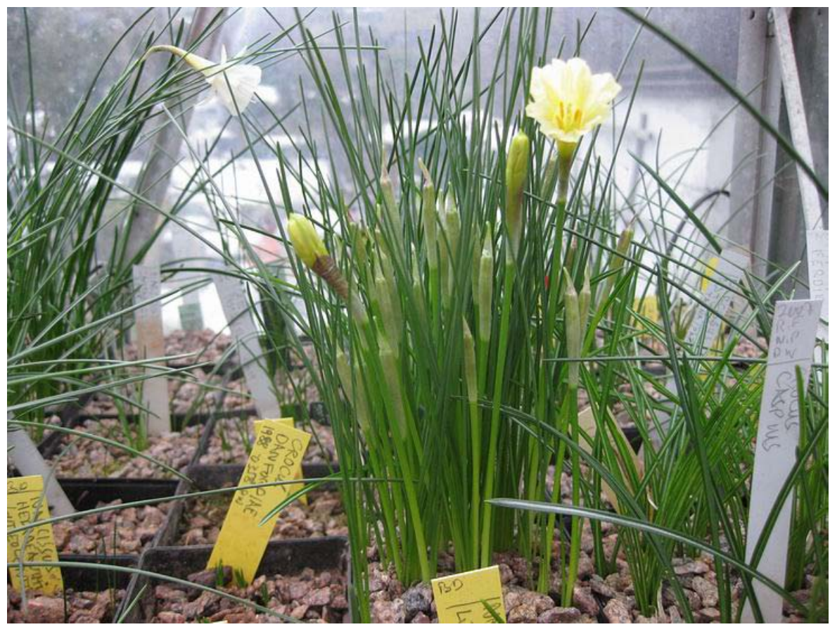
Narcissus 'Craigton Clumper'

Last week I showed a pot of Narcissus 'Craigton Clanger' here is another of my selections, Narcissus 'Craigton Clumper' which was selected because it increases and clumps up very quickly indeed. Young Narcissus bulbs raised from seed always show more vigour than old forms that have been increased vegetatively over many years and perhaps picked up diseases on the way. These ones I selected stood out from their fellow seedlings by being exceptionally vigorous; producing some forty flowers from a 7cm pot.