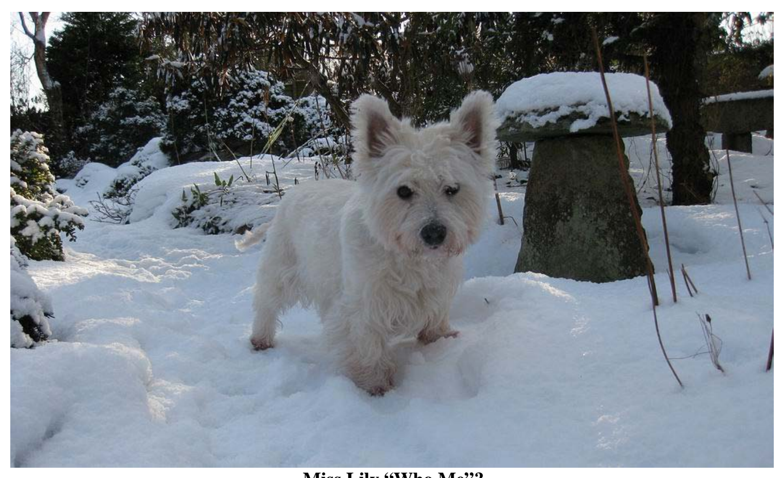
Miss Lily "Who Me"?

I will finish off this week's Bulb log with two pictures of one Lily who is perfectly hardy and is not damaged by the snow; in fact she loves it.