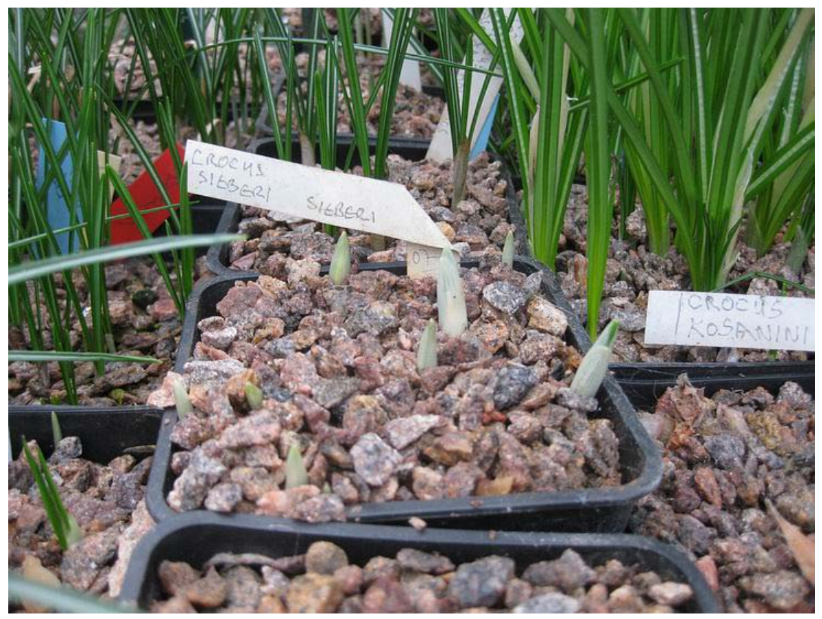
Crocus sieberi sieberi shoots

As well as the lovely flowering Narcissus it is the expectation of all these fat shoots bursting in to bloom soon that helps me through the frustration of not getting into the garden in the snow. These are mature corms of Crocus sieberi sieberi with shoots that are big enough to flower every year.