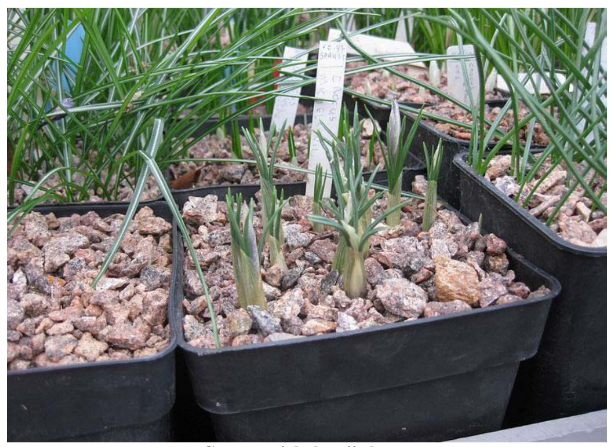
Crocus michelsonii shoots

On the other hand I must remember to repot and split out this pot of Cyclamen cyprium seedlings. Even though they will grow well crammed in together they do like a bit more room and you can see that they are already starting to push on the sides and distort the pot.