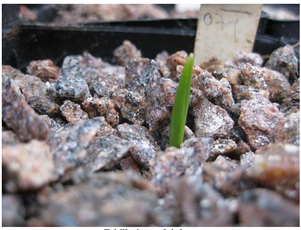
Fritillaria purdyi shoot

As this picture shows I have no covers on this outside frame - the snow cover is the best form of cover I can get in these cold times. I have been placing some of the snow that I remove from the glasshouse roofs onto this frame because the snow acts as an insulating layer against the worst of the cold. Again I will have to wait for several months before I know if any of the bulbs in this bed have been damaged by the frosts. I lost a lot of my pots of Narcissus cyclamineus that were in a similar frame during the last big freeze we had some ten years ago.