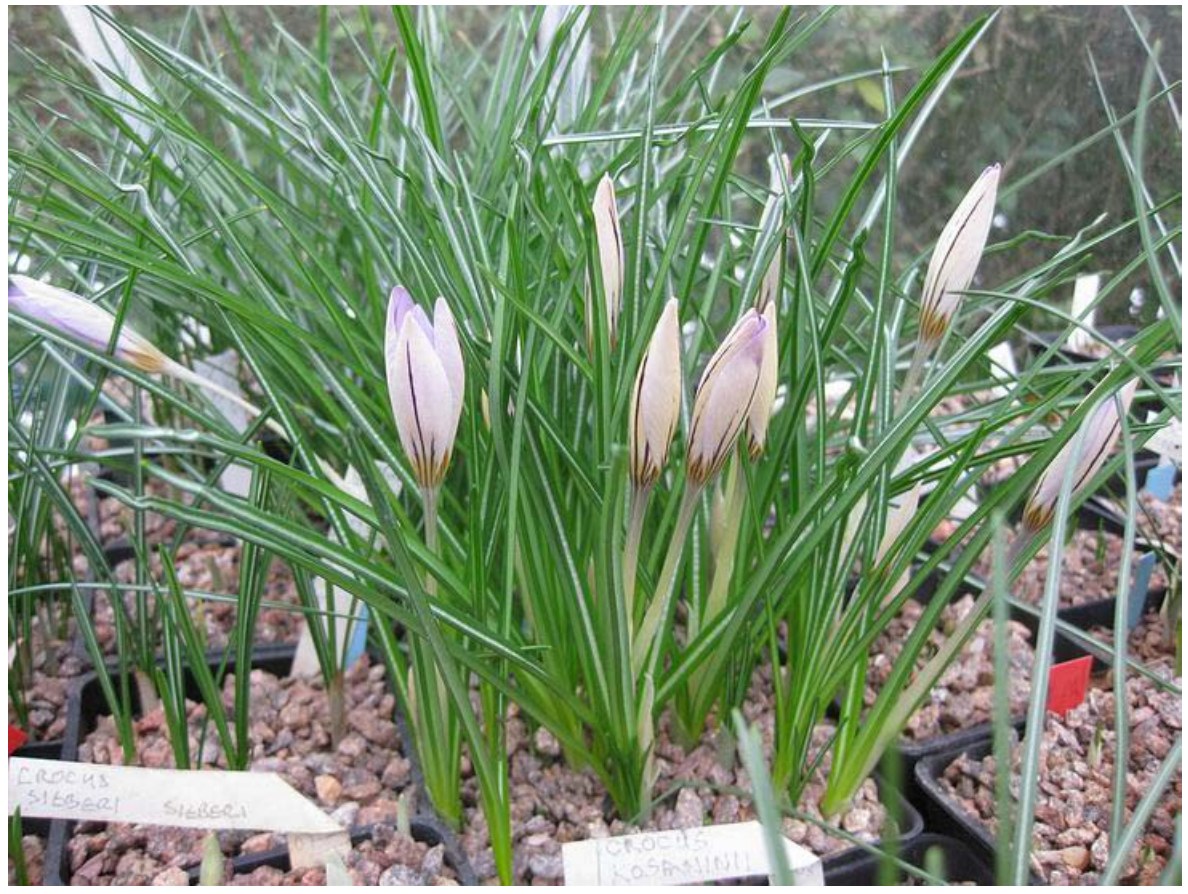
Crocus imperati suaveolens

Here again is a pot of Crocus imperati suaveolens whose buds have not been damaged at all by the deep frosts that they have been subjected to over recent weeks.