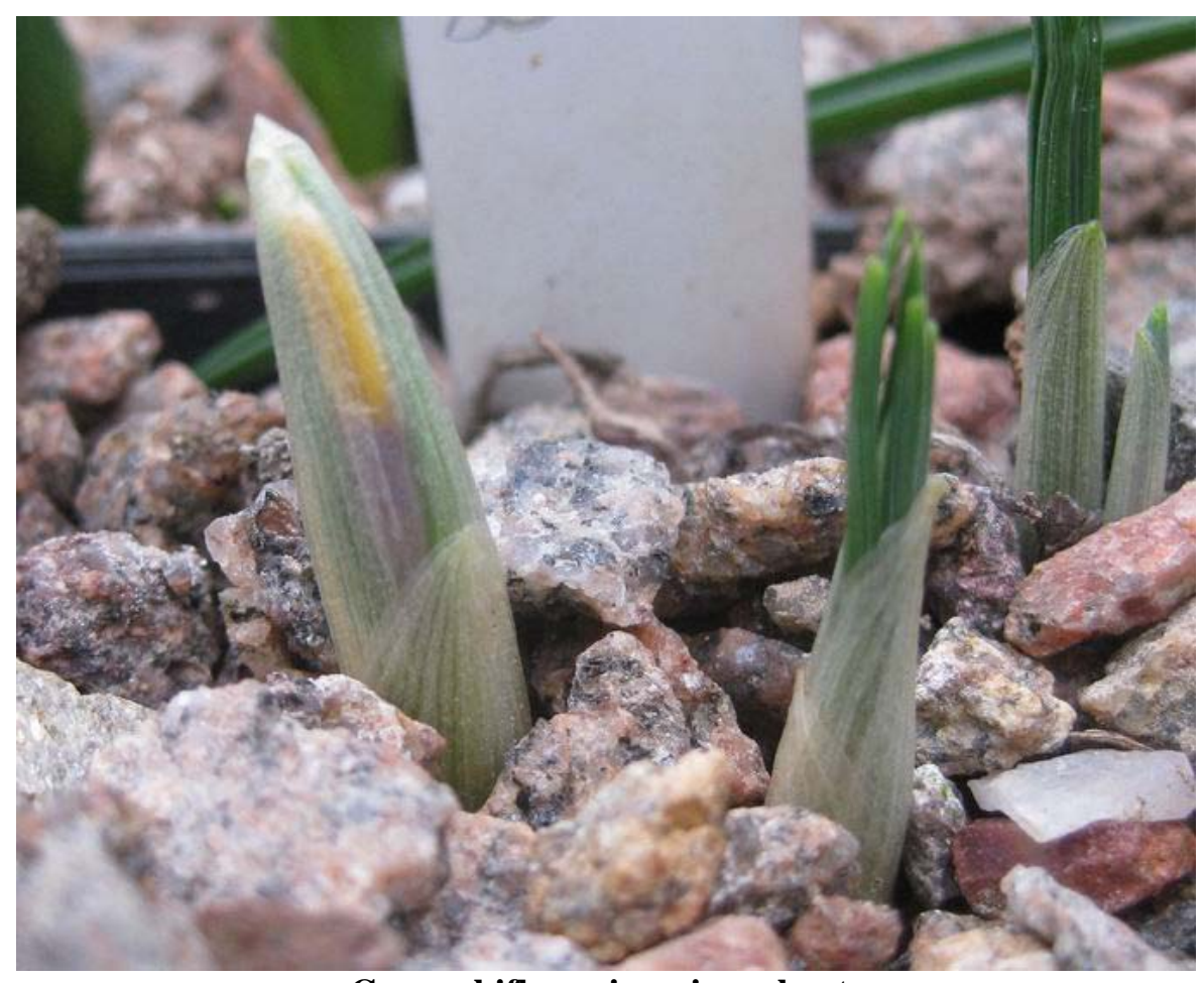
Crocus biflorus isauricus shoots

Likewise these Crocus biflorus isauricus shoots are also playing the waiting game for a bit of warmth.