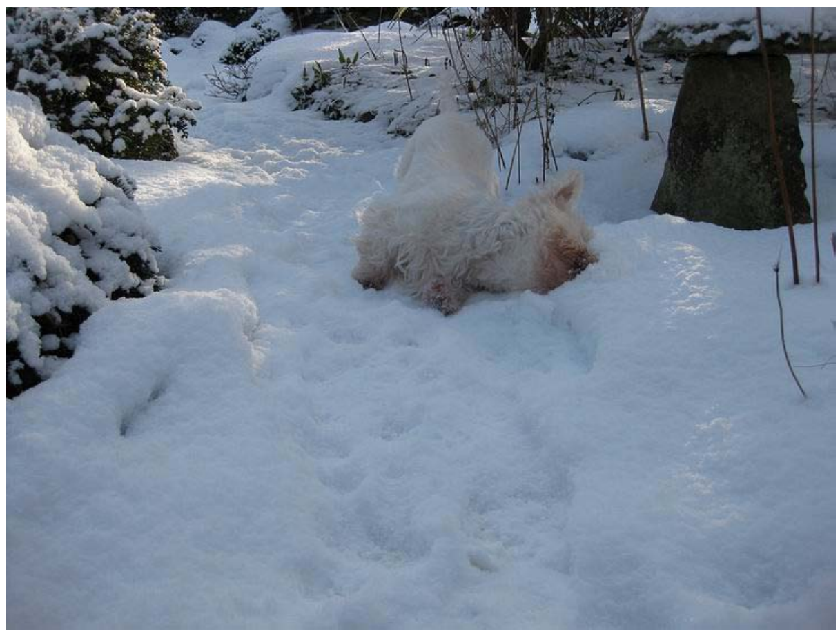
Miss Lily has a roll in the snow

I will finish off this week's Bulb log with two pictures of one Lily who is perfectly hardy and is not damaged by the snow; in fact she loves it.