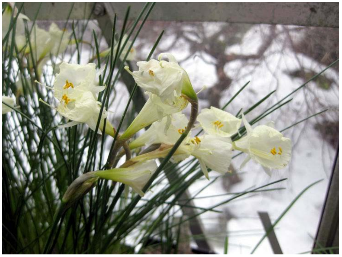
Narcissus 'Camoro' flowers after the frosts

Here again is a pot of Crocus imperati suaveolens whose buds have not been damaged at all by the deep frosts that they have been subjected to over recent weeks.