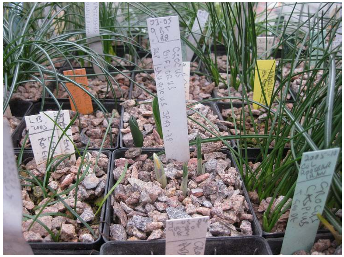
Crocus biflorus isauricus shoots

Likewise these Crocus biflorus isauricus shoots are also playing the waiting game for a bit of warmth.