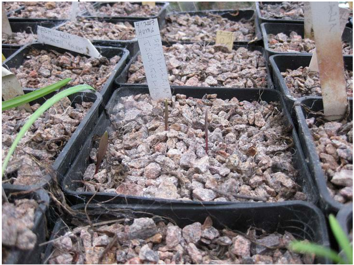
Fritillaria tortifolia seedling leaves

Although I have not shown it previously, this shoot of Fritillaria tortifolia has been above ground for at least three weeks – well ahead of the other pots I have.